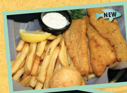
Alaskan Scrod Basket

Nearly 3 quarters of a pound of our new scrod gently fried and served with French fries. $6.99 substitute any other side for $1.00 more.