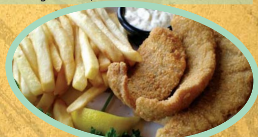
Alaskan Scrod Sandwich Platter

Pan-Fried Oyster Sandwich Fresh oysters from the Chesapeake Bay, hand-breaded on a toasted hoagie bun. $8.49