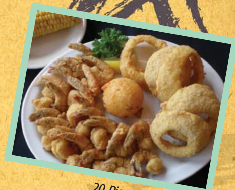
20 Piece Shrimp Feast

Bite-sized shrimp, fried to perfection. $8.99