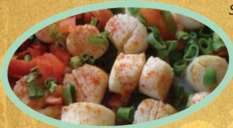
Broiled Sea Scallops

Served with two sides and hot hush puppies.