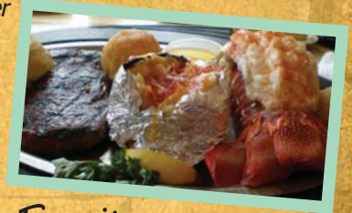
Surf & Turf

The Pilot House Favorite A thick 10 oz. ribeye $17.99