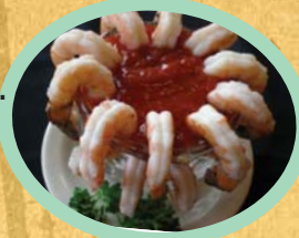
Large Shrimp Cocktail

Chilled shrimp with our tangy sauce. Large $10.99 Regular $7.99