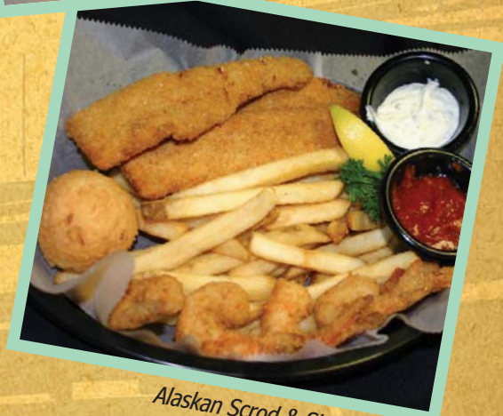
Alaskan Scrod & Shrimp Basket