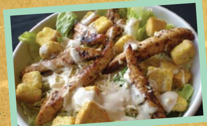
Blackened Chicken Caesar Salad

Our house dressings are homemade: Thousand Island and Bleu Cheese. We also have Ranch, Honey French, Honey Mustard, Balsamic Vinaigrette, Fat Free Ranch, Fat Free Italian and Vinegar & Oil.