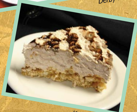
Kentucky Silk Pie